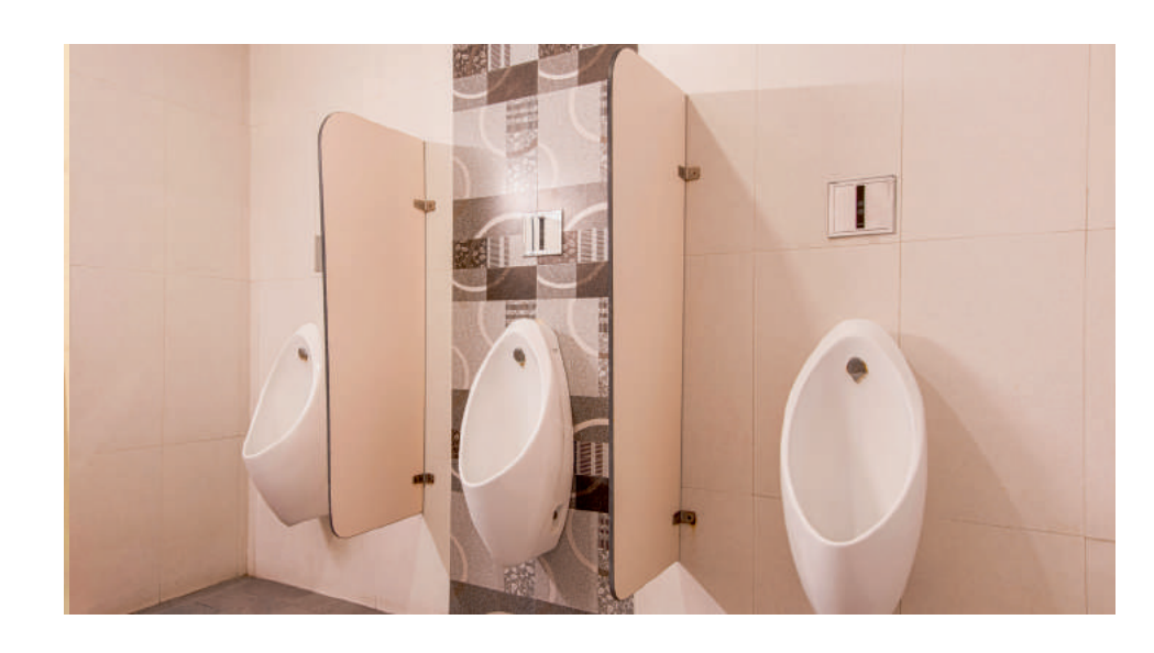
QMax Test Equipments, OMR